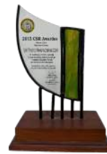
2015 CSR AWARDEE